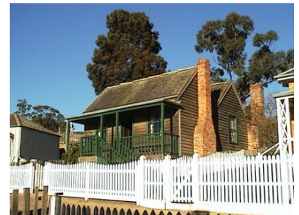
A wooden cottage at Sovereign Hill